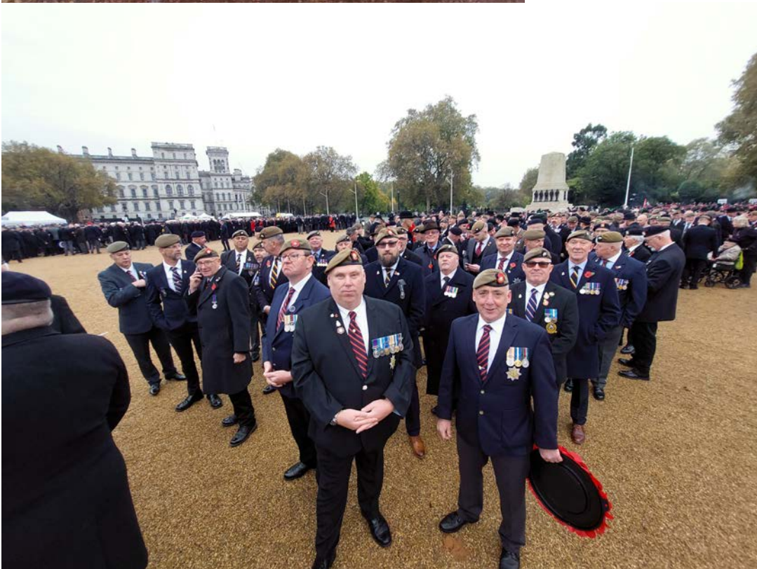
Royal Anglian Association Members Formed up on Horse Guards

The Grimsby Branch Members joined the RANGLIAN marching contingent on Horse Guards. Attendance at the parade and at the Garden of Remembrance grows every year.