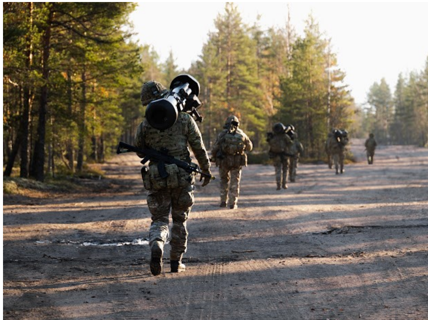
Ex Hammer - 1st Battalion Deployed with Finnish Anti Tank Troops

Battalion HQ were tested in their first experience of CAST as a Security Force assistance (SFA) Headquarters on Ex LAND WARRIOR. Staff Officers and enablers were exercised in planning and execution as part of the Allied Response Force Land Component. The three week exercise in Warminster proved to be an exceptional opportunity in shaping the warfighting capability of an SFA battalion. I R Anglian were utilised heavily by I Div HQ in the initial phases of the operation, and the concept of pre-emptive SFA deployment with partner forces to shape the operating environment was thoroughly proved.