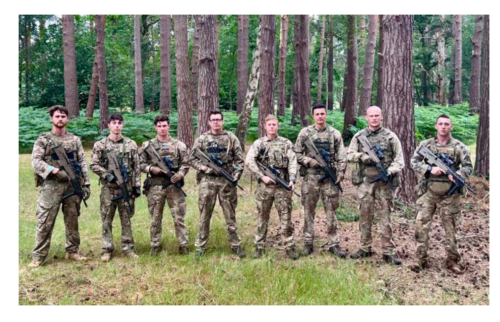
The Battalion's Operational Shooting Competition (OSC) Team travelled to Bisley to compete at the Army Operational Shooting Competition. Consisting of 7 soldiers and 1 Officer, placing 6<sup>th</sup> in the Infantry and 14<sup>th</sup> overall.

The 2<sup>nd</sup> Battalion Royal Anglian Battlegroup Headquarters completed their validation by Command and Staff Training (CAST) Group from Land Warfare Centre (LWC) on Salisbury Plain Training Area. Supported by the Joint Fires Cell from 5<sup>th</sup> Regiment, Royal Artillery and 26 Squadron, 32 Regiment, Royal Engineers.