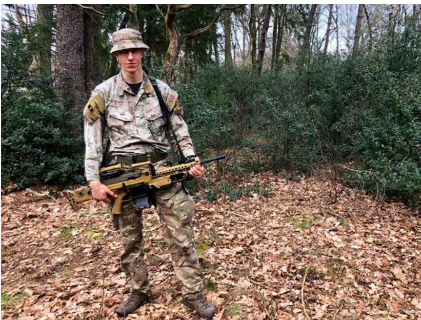
A soldier of 1 Coy 3 Royal Anglian getting familiar with the German Machine Gun MG5.

For example, 3 Royal Anglian has much more recent and ancient history, is busier and better established and has a much larger core of regular soldiers to support its operation. We are not there yet, but having an older brother like this certainly helps us on our way”.