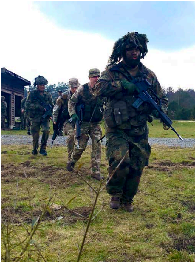
A joint German/British tank Anti-Tank team in action during an exercise in Bergen/Loheide, Northern Germany, March 2023. 3 Royal Anglian sent three soldiers from 1 Coy on a first exercise visit.