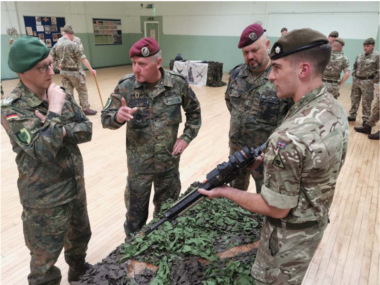
The Initial Visit to Norwich Highlighted Many Similarities Between the Battalions