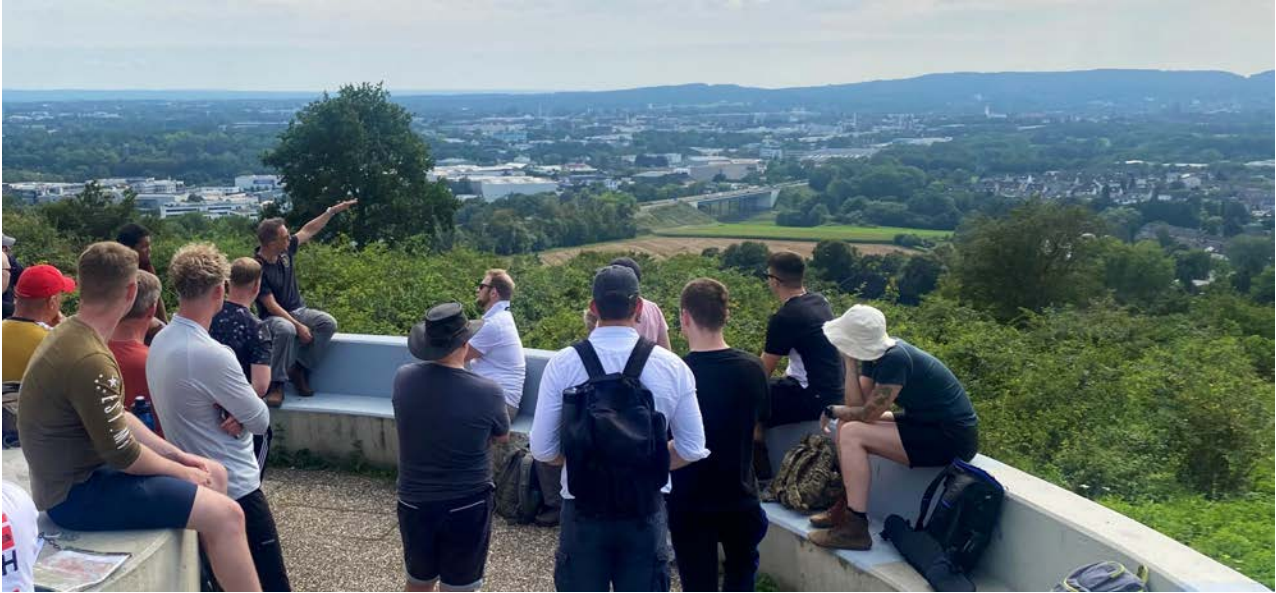
Discussing the options for encirclement of Aachen

24 members of 3 R ANGLIAN deployed to Germany over the week of the 21-25 August on Ex Steelback Aachen, a Battlefield Study to focused on operations conducted by US forces during the initial penetrations into Germany in Sep-Dec 1944.