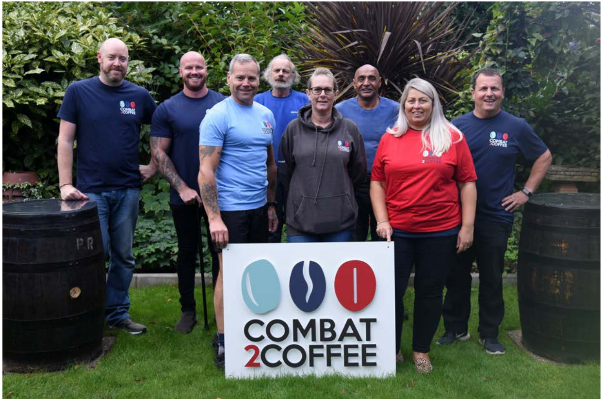
The C2C Team

“Mental Health & Wellbeing Coffee Shop”, Coffee2Keep, Open Today at the Constitutional Club, at 12 Guildhall Street., Bury St Edmunds - Opening hours will be Mon to Sat 0900 – 1600hrs.