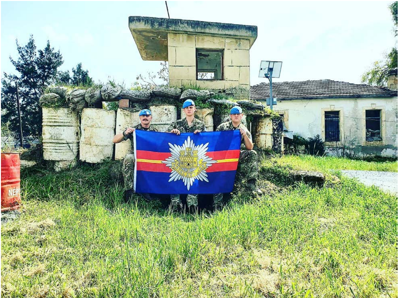
Steelbacks on Operations, Patrolling the Green Line