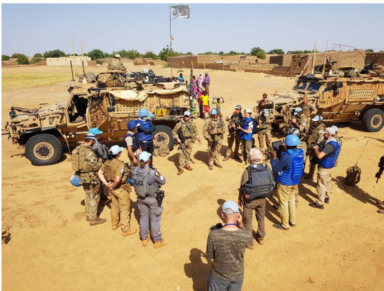
A Poachers Pre-Mission brief for the French Media

The 2 Royal Anglian-led task group currently deployed in Mali were involved in a brief firefight during October. Out on a patrol, soldiers from the Queens Dragoon Guards, currently attached to the Poachers came under fire from two men believed to be from the Islamic State terror group. The task group were taking part in their final patrol of their tour, conducting a reconnaissance mission from Menaka to the nearby village of Indelimone, trying to find a new route between them after regular routes had come under continual attack from militants. November will see the 2 Royal Anglian task group complete its final long range patrol before they look to hand over and return to the UK.