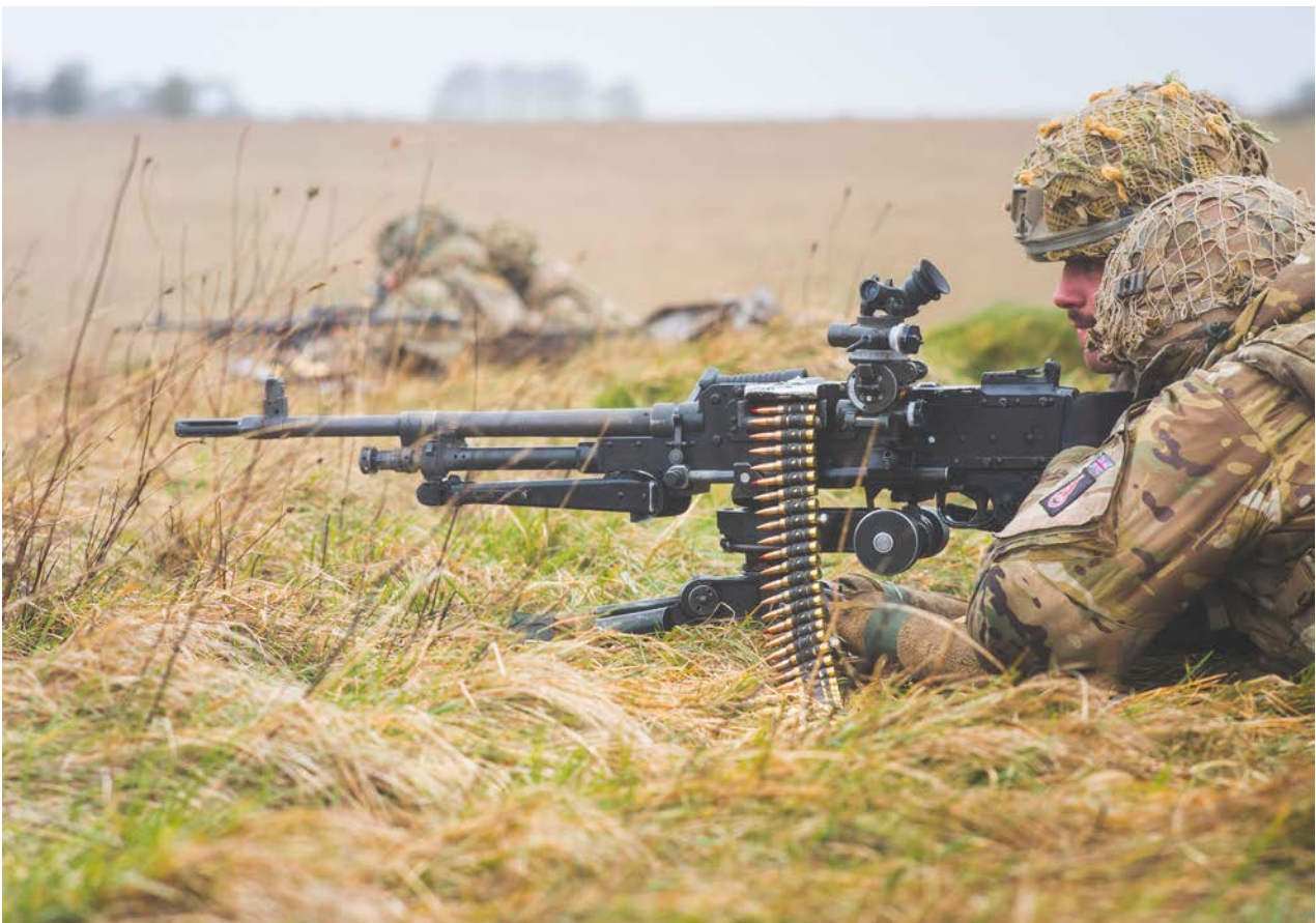
Machine Gun Platoon of the 2nd Battalion Live Firing - February 22

If you've changed your name, moved house or no longer qualify for Gift Aid due to a change in tax circumstance, please let us know by calling us on 01284 752394 or by emailing Mark.goldsmith101@mod.gov.uk