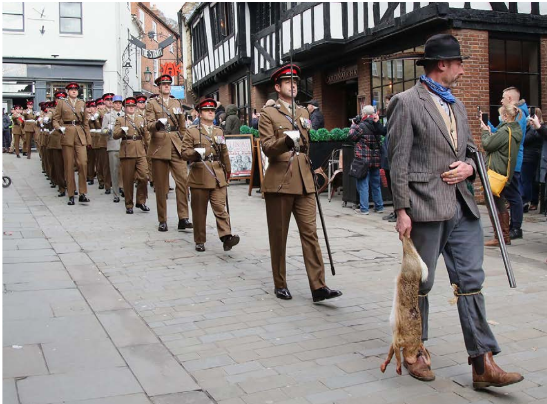
The Battalion marching down the High Street, led by The Poacher

On 4 February, the 2nd Battalion, 'The Poachers' were honoured to exercise the Freedom of the city of Lincoln. The Freedom for the Battalion dates back to 1997, and the parade was one of the first ceremonial events for the Battalion in recent years. The Freedom gives the Battalion the honour to march through the City with 'bayonets fixed, colours flying and drums beating'.