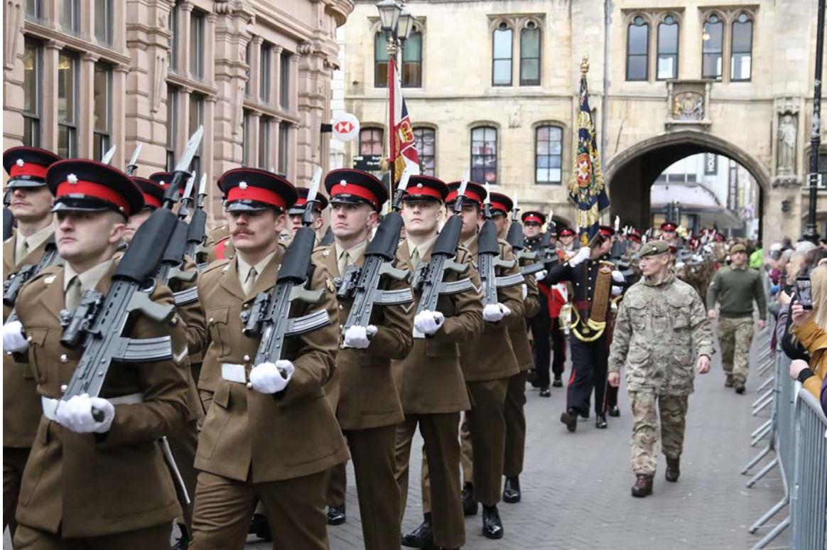
Bayonets fixed, Colours flying, and Drums Beating, the 2nd Battalion on the March!

The battalion marched off to the music of 'The Lincolnshire Poacher' and a resounding round of applause from the sizeable audience that had gathered in the city centre. Veterans, families, friends and civilians had all gathered to watch the parade and it meant a lot to everyone from the Battalion.