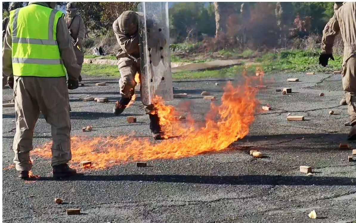
A (Norfolk) Company dealing with an incoming Petrol Bomb

During January The vikings conducted Public Order training to re-validate as part of their commitment to the Regional Standby Battalion. All three rifle companies, and support company underwent a testing three day package to hone their skills. As always the civilian population drawn from other companies put the exercising troops through their paces. The training package went back to basics as some soldiers had never conducted public order training before. Starting with the basics of how equipment is worn and simple shield drill the accelerated learning package saw companies conducting night clearances two days later. All companies ended the package having successfully validated for a further 12 months. Whilst a key training requirement to be the Regional Standby Battalion, the training is also important as we look to our second year in Cyprus when we will assume responsibilities as the Cyprus Operations Battalion.