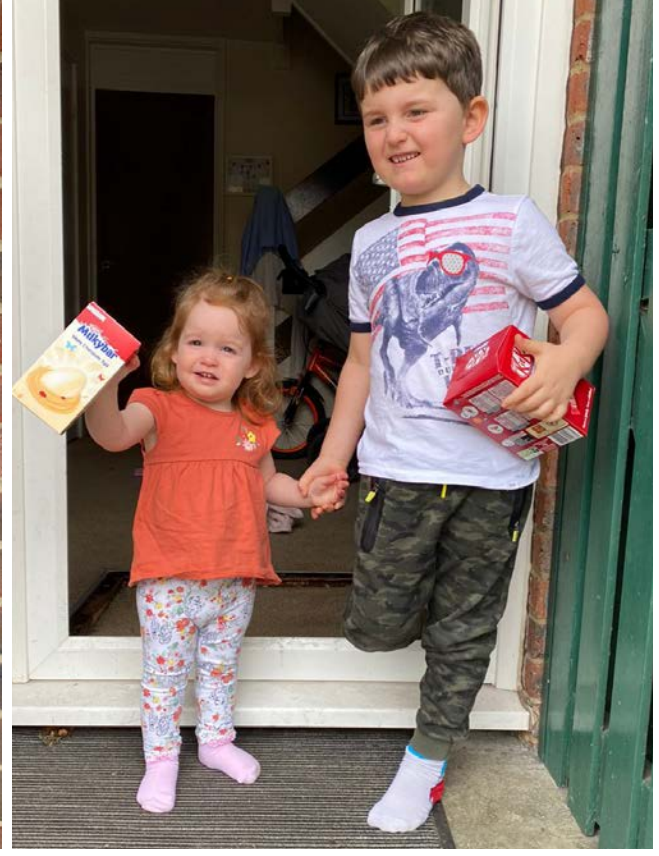
Happy Easter from the Poulters!