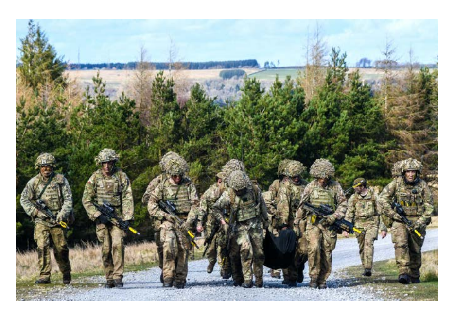
Train hard, Fight Easy - A Section carrying out Casualty Evacuation

The Vikings spent the first half of April on Easter leave, drawing a line under an extremely busy first quarter. As the Commanding Officer briefed the Battalion after a final arduous CO's PT, whether it has been on Op RESCRIPT, in Ghana, across the UK, or supporting 7 Brigade in the US, the Vikings have constantly performed well over the preceding months. After packing away the tyres, and the jerry cans, and the weights, and the logs (you get the picture!), everyone departed on two weeks leave for some well-earned time with family and friends. Maintaining their strong connection with the Regiment, the Worshipful Company of Poulters kindly ensured those soldiers with families went on leave with a clutch of chocolate eggs (ideally for the children!) The Vikings — along with the Poachers and Steelbacks — thank the Poulters and RHQ as well as the Vikings Welfare Team for their involvement. These kind touches underline our ethos: a county-based Regiment, bound together by a closely-knit family spirit.