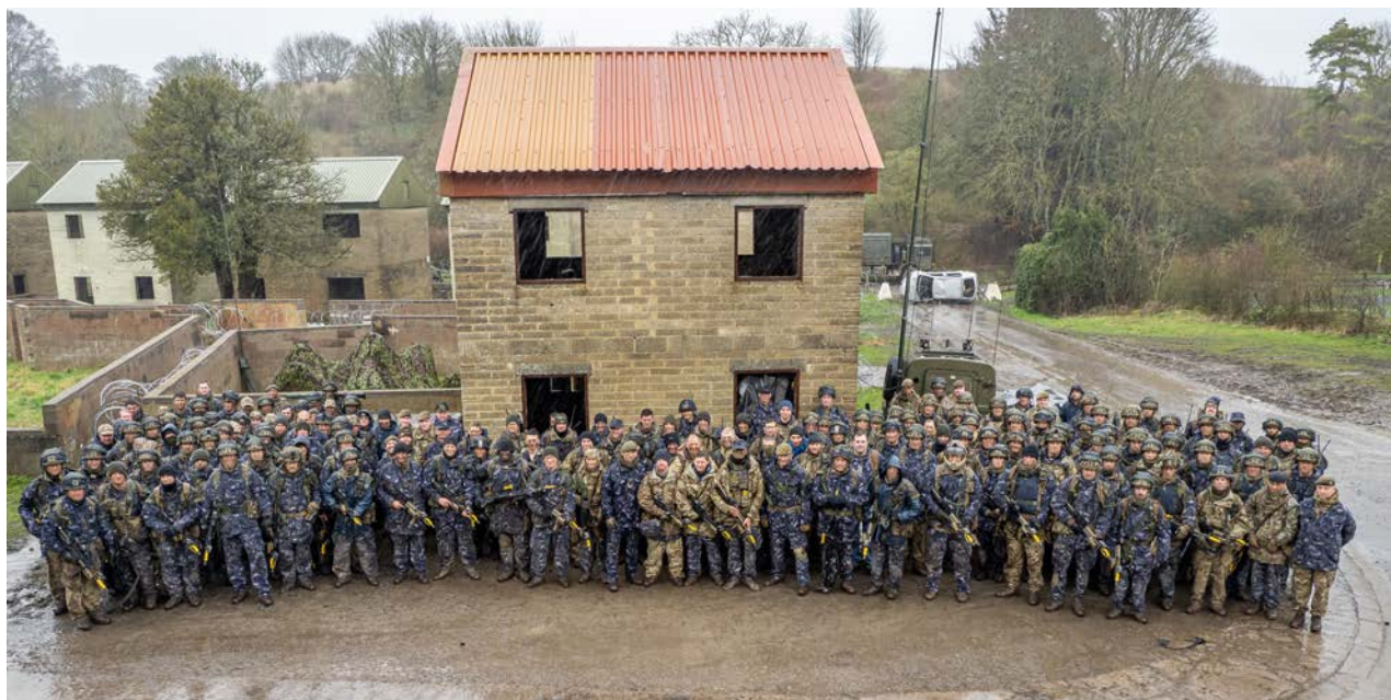
Task Force Hannibal at the end of the Exercise