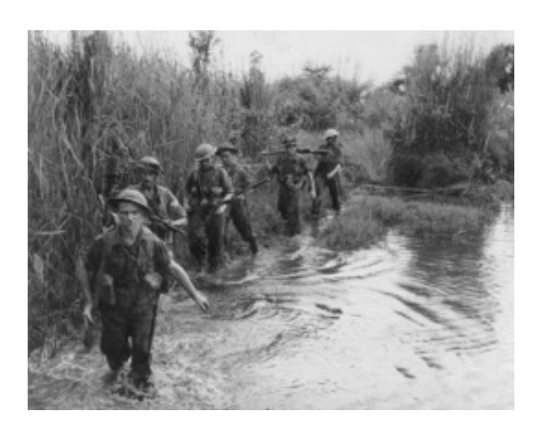
2<sup>nd</sup> Bn The Suffolk Regiment in the Arakan.

On 15 August 1945 Japan announced its surrender and this day was designated 'Victory over Japan' or VJ Day. For the United Kingdom this marked the official end of the Second World War.