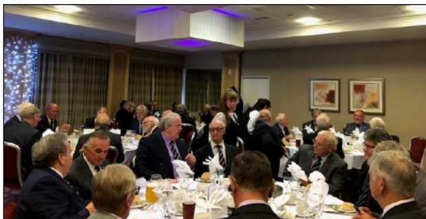
Diners enjoying the evening.