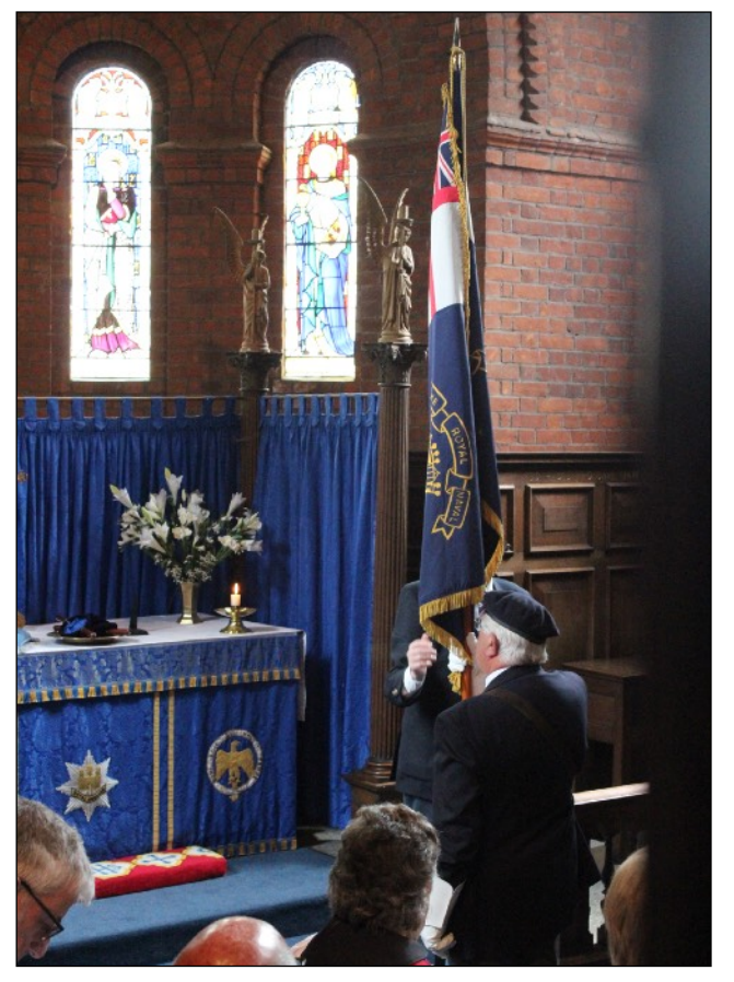
Bentwood Royal Navy Standard rededication.