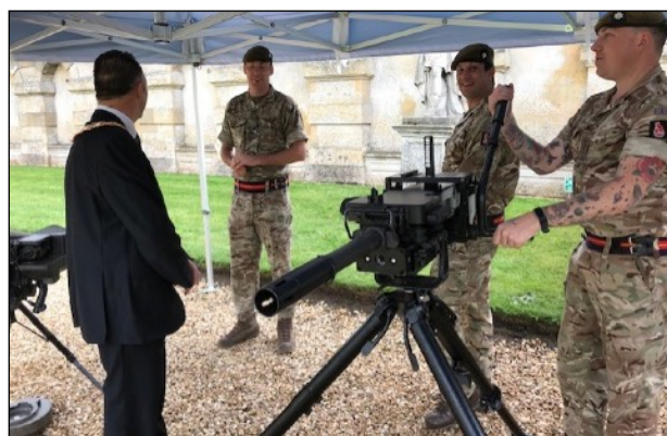
The Mayor of Bourne speaks to members of the RST.