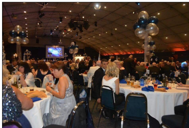
Guests enjoying their evening.