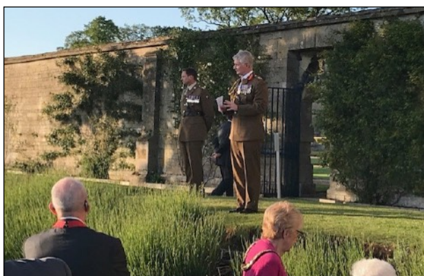
The Colonel of the Regiment addresses his guests.