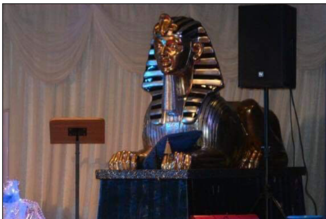
One of the two Sphinx's' commissioned for the evening.