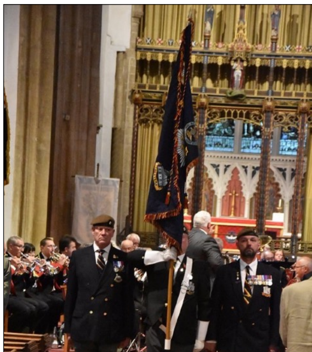
The Colour Party parading the dedicated Standard.