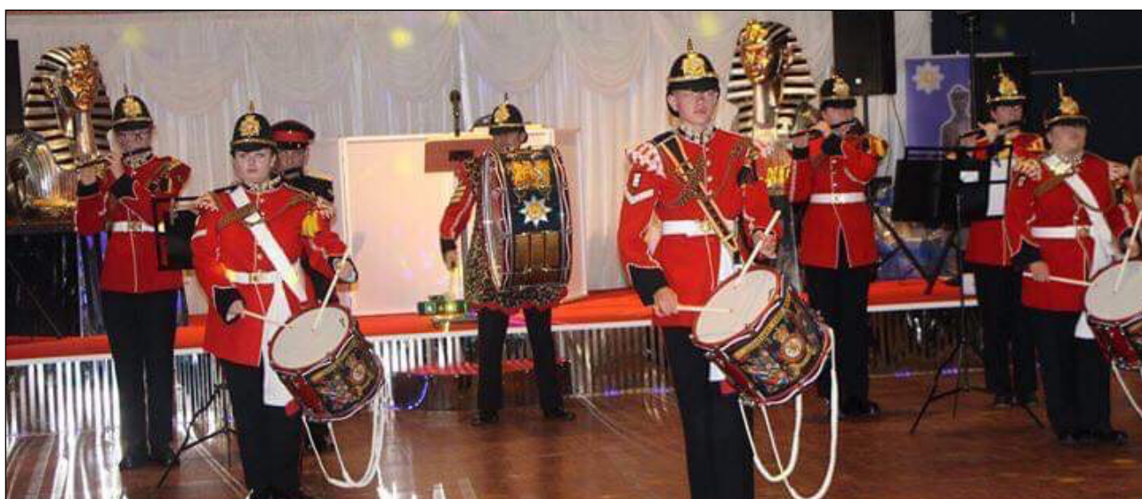
Corps of Drums, Essex ACF.