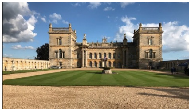
The Quadrangle at Grimsthorpe Castle

Following the party our guests moved onto the spectacular setting of the quadrangle for a full Beating of Retreat and sunset ceremony performed by the band of the Parachute Regiment soon to be renamed as one of the army infantry bands. Music included the theme tune from Band of Brothers which had been performed the previous week in Normandy for the D-Day commemorations, various Regimental marches including Rule Britannia, Speed the Plough and the Lincolnshire Poacher.