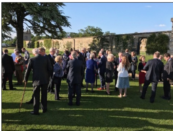
Guests on the West Lawn.