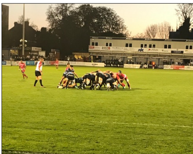
Action from the game which saw the Blues come out on top.