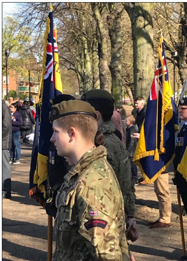
Cadets from Bedford Modern School CCF attended the parade.