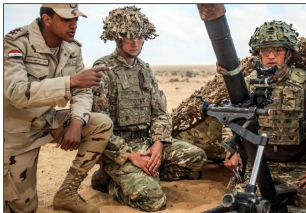
Discussion between an Egyptian officer and a mortar team of The Poachers.

The first bilateral exercise for thirty years between Egypt and the UK has successfully come to its conclusion. Exercise AMHOSE I saw the participation of 165 UK military personnel from Cyprus based 2nd Battalion, The Royal Anglian Regiment "The Poachers", in a joint exercise with members of the Egyptian 112 Infantry Brigade.