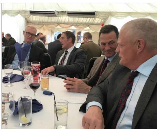
Enjoying the pre-match hospitality.