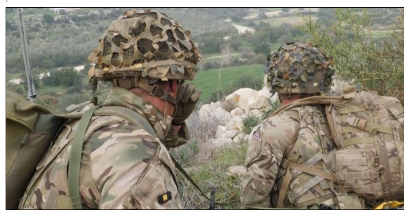
Article courtesy of Forces News.