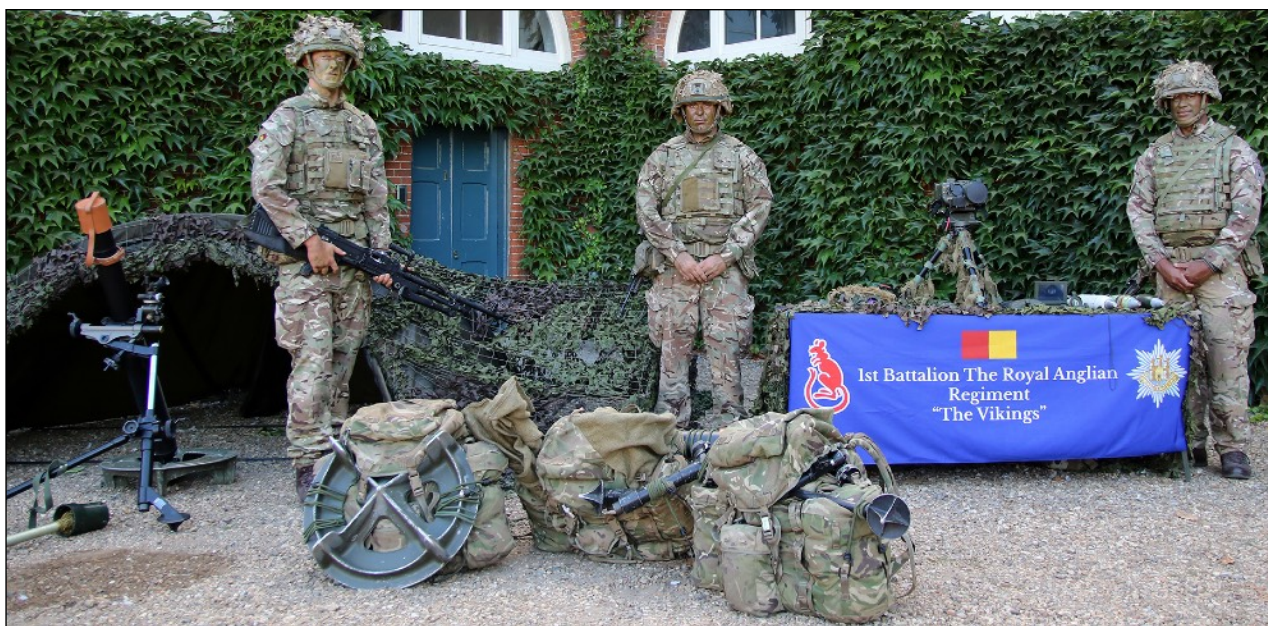
Viking Mortar Platoon static display.