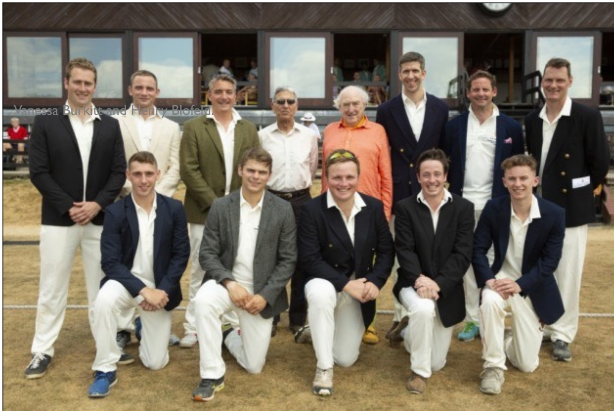
The Royal Anglian Regiment XI.

Cambridge War & Peace 1914-18 Celebrity Cricket Match – Saturday 8 July 2018