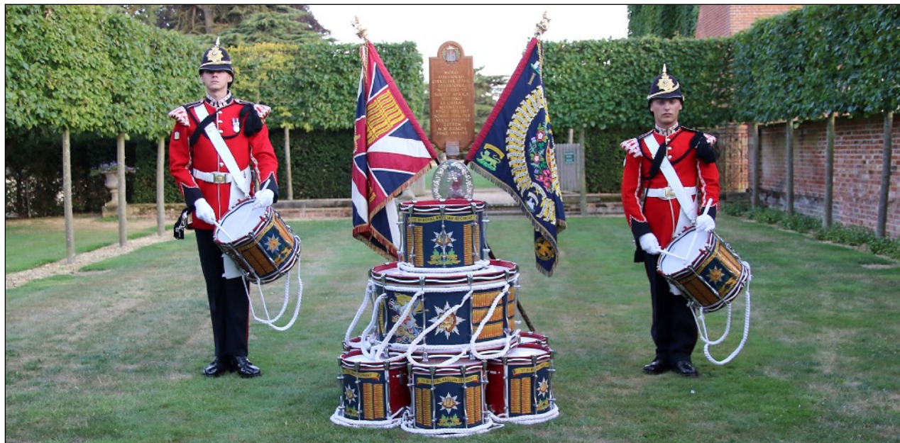
The Viking Colours and Drummers on parade.