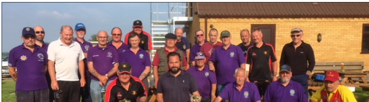
Pompadours on the Bank, Open Fishing Competition participants.

Match 3 - Fri 27 Sep 19 Rookery Waters Pidley – Magpie Lake