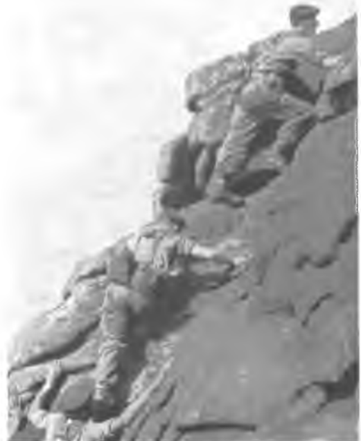
Adventure Training. Members of "B" Company rock climbing.

The 3rd Canadian Infantry Brigade Group consisted of 1st Bn. The Black Watch of Canada,