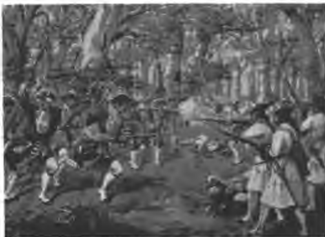
THE 16th REGIMENT OF FOOT AT MALPLAQUET SEPTEMBER 11th 1709