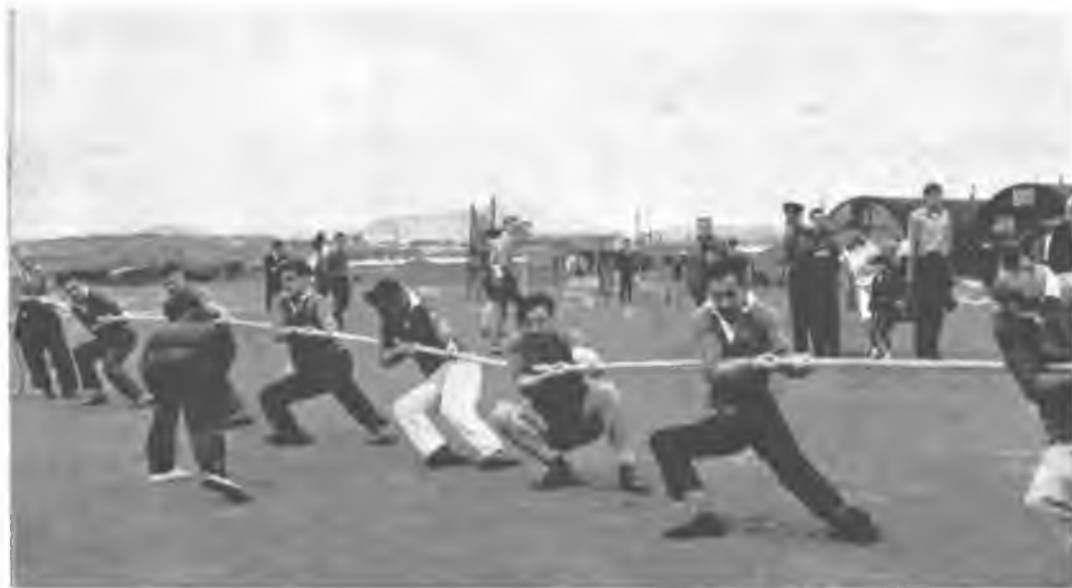
Blenheim Day, 1963. The Sergeants' Mess team in the Tug-of-War, which was won by the Officers' team.