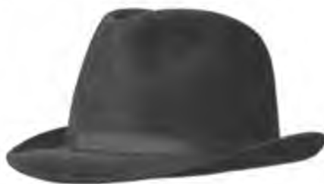
Dual-purpose hat, in brown, green or grey. Style 6153