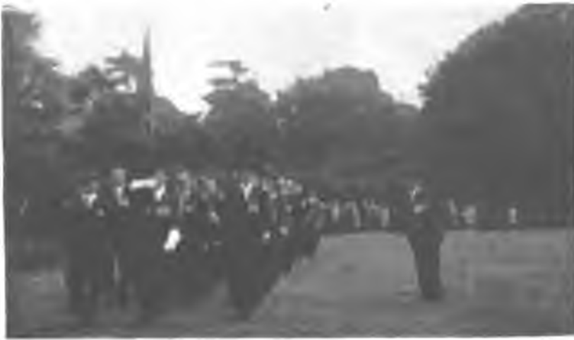
The Essex Regiment Association Service of Remembrance, Warley, July 7, 1963 — The march past.