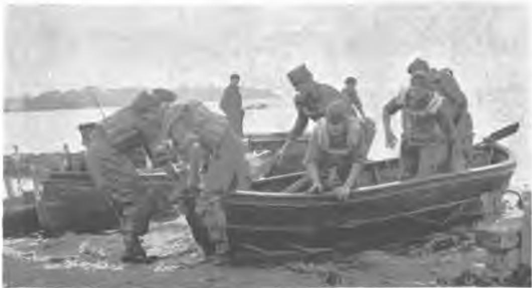
Exercise "Hell Bent." A team from "B" Company.