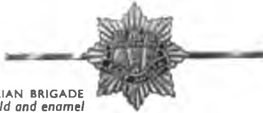
E. ANGLIAN BRIGADE 9 ct. gold and enamel