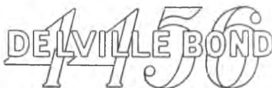
Reproduction of the watermark

An attractive Writing Paper that perpetuates the name of a great battle and the two Numbers of Foot which designated the 1st and 2nd battalions of The Essex Regiment.