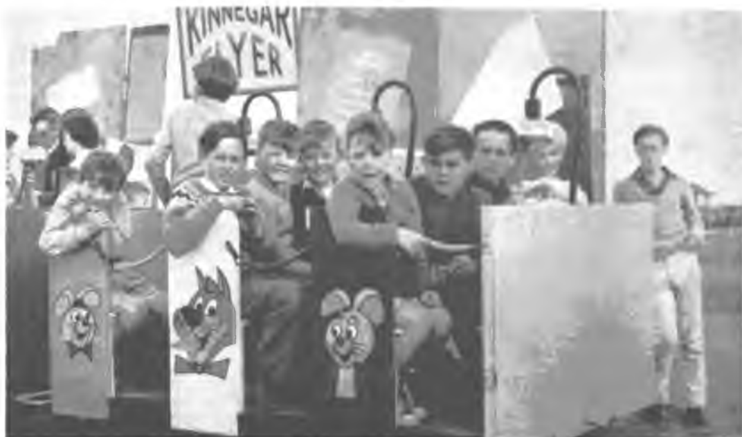
Blenheim Day, 1963. The Kinnegar Flyer.