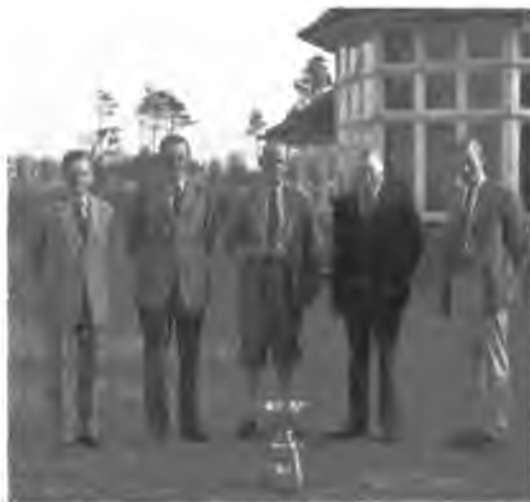
REGIMENTAL GOLF TEAM

In the Ordnance Cup against a very low handicap Royal Artillery team the Regiment, though beaten by 17 holes to 3, were by no means disgraced.