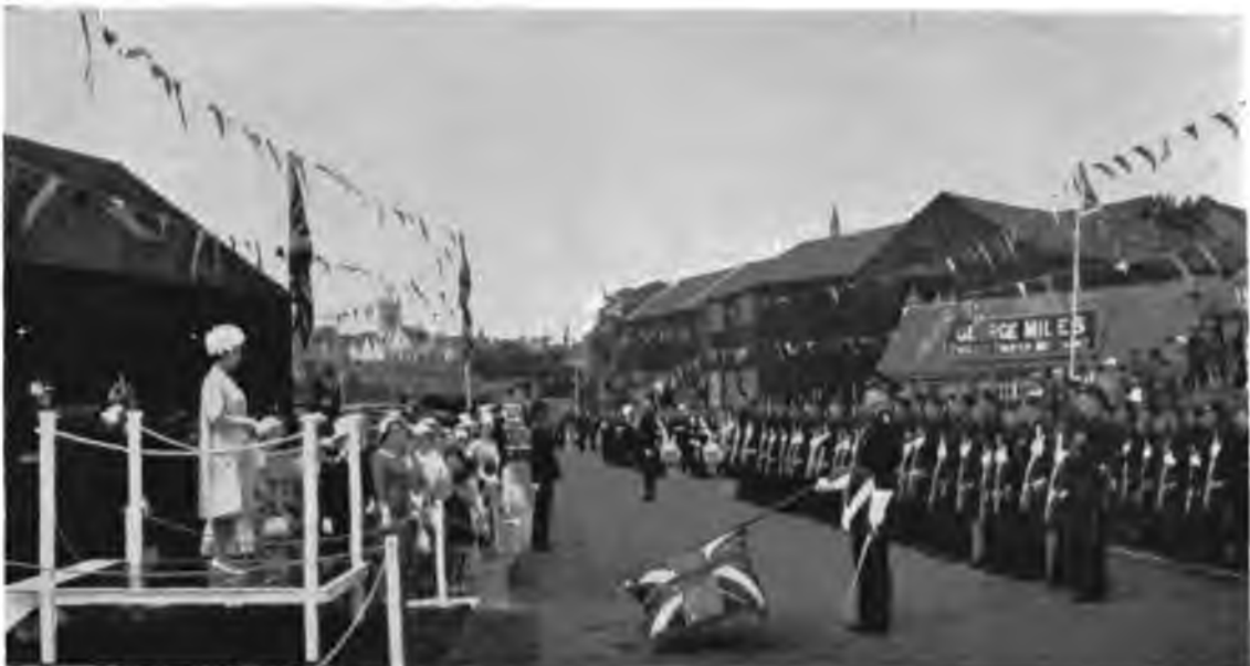
Royal Salute, Stamford, 19th June, 1961