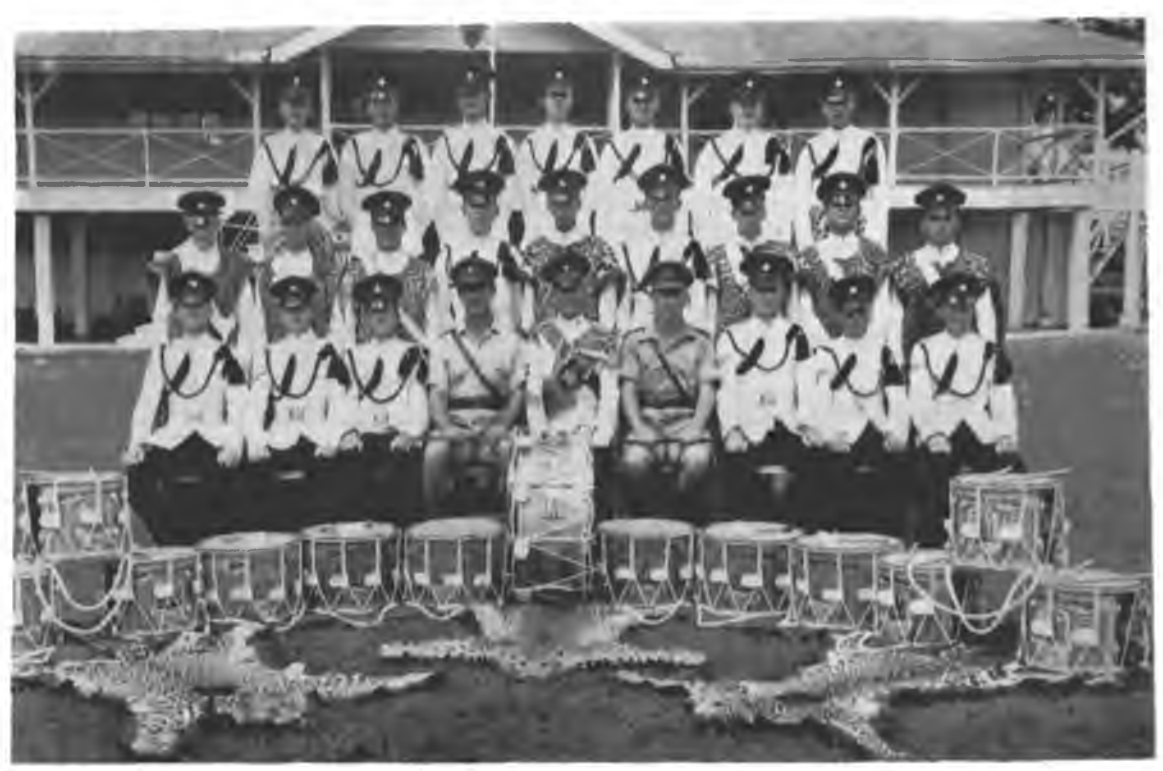
Corps of Drums of the 1st Battalion, British Guiana, 1962