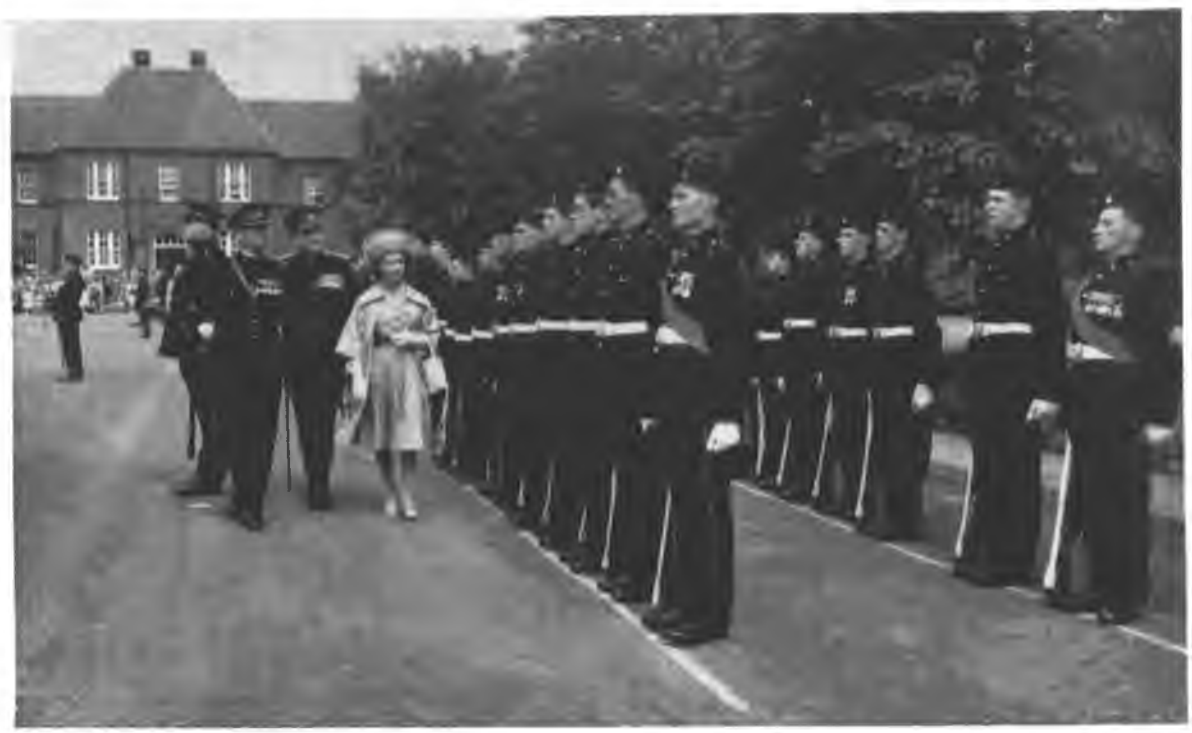
The Colonel-in-Chief inspecting the parade