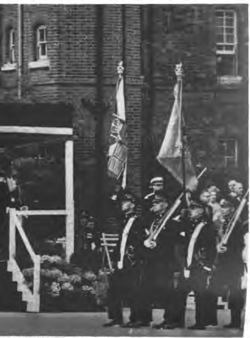
of 4th Su. The Royal Norfolk Regiment