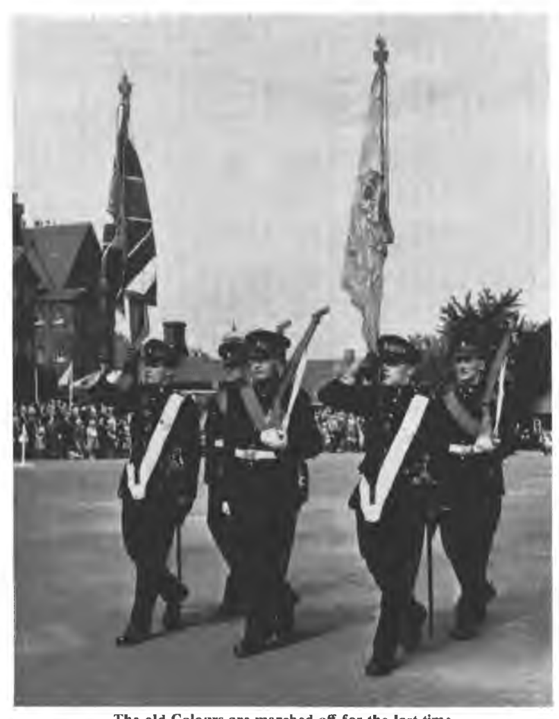
The old Colours are marched off for the last time