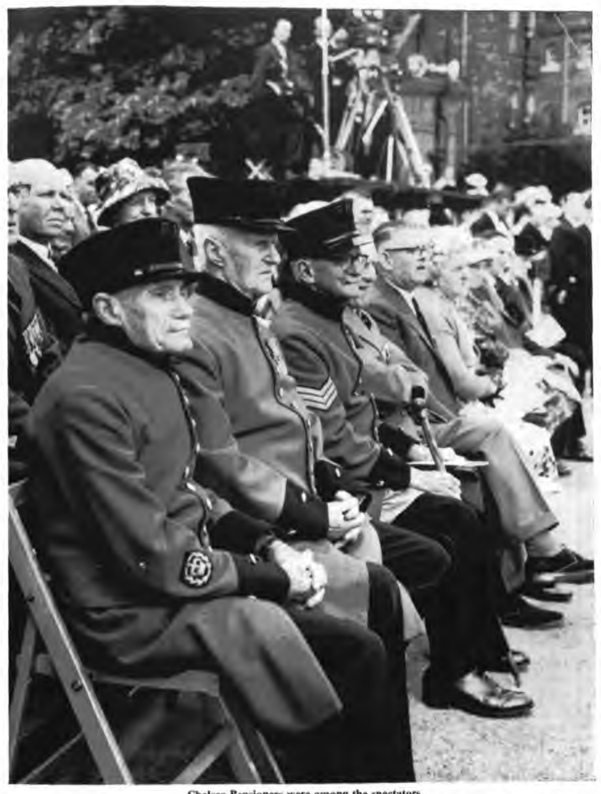
Chelsea Pensioners were among the spectators