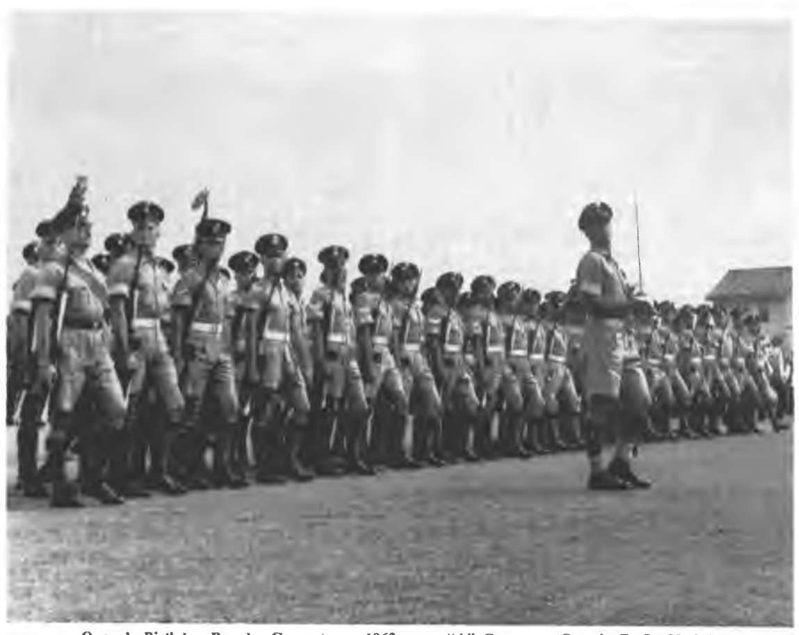
Queen's Birthday Parade, Georgetown, 1962.