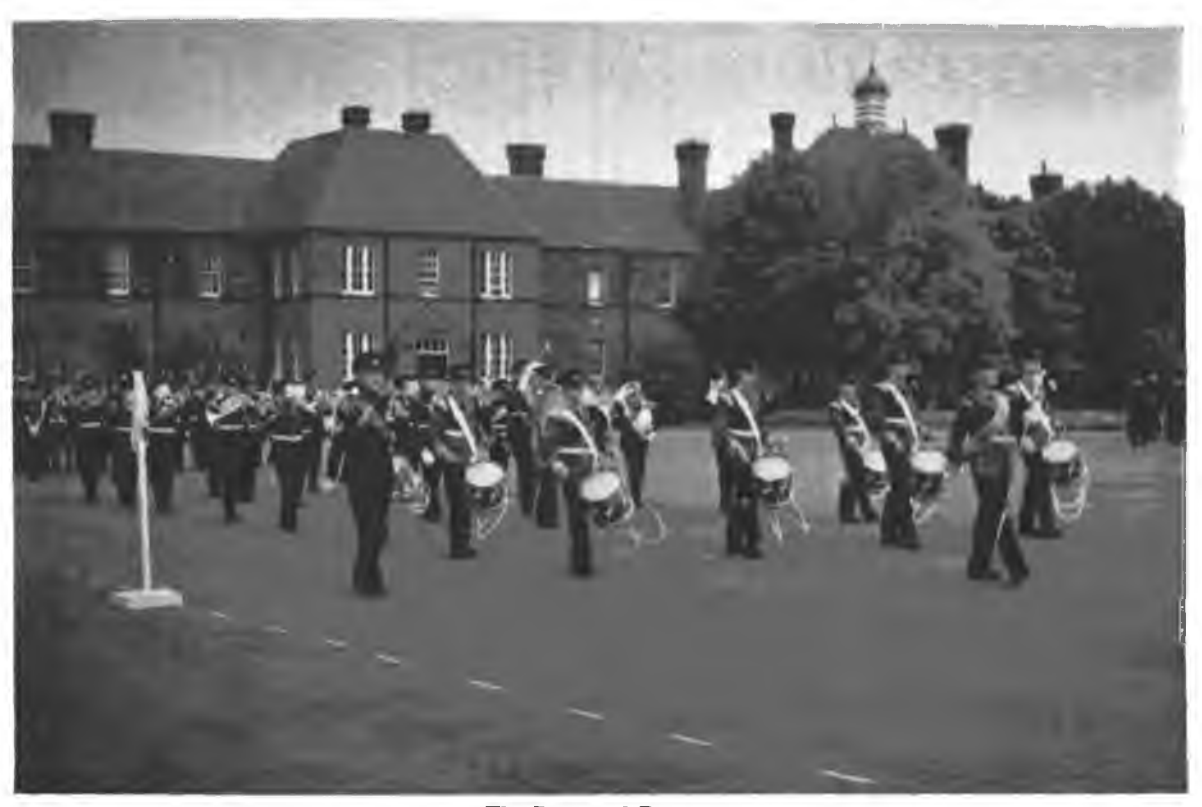
The Band and Drums