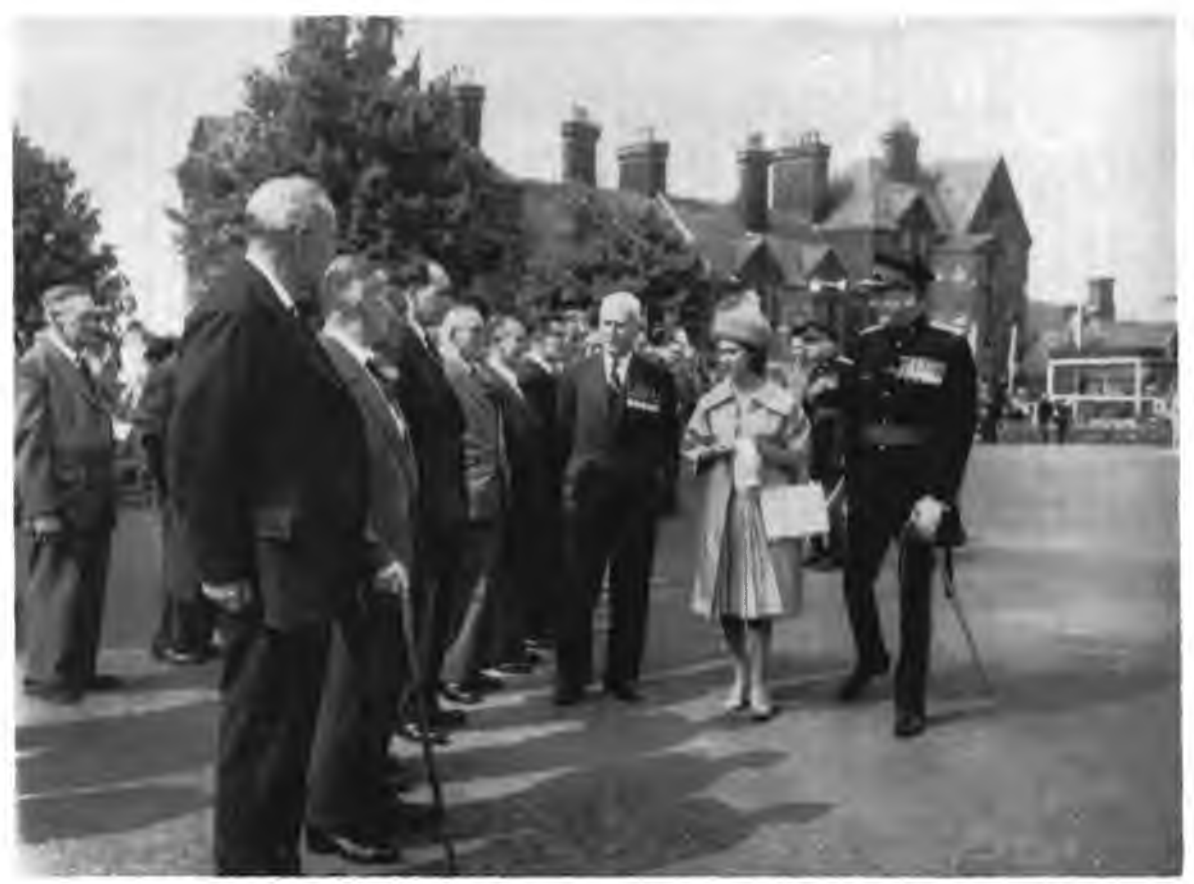
Presentation of new Colours to 4th Bn. The Royal Norfolk Regiment (T.A.) The Colonel-in-Chief meets former members of the Regiment