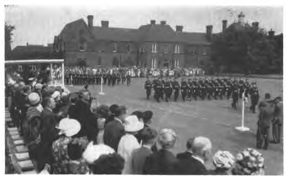
The March Past