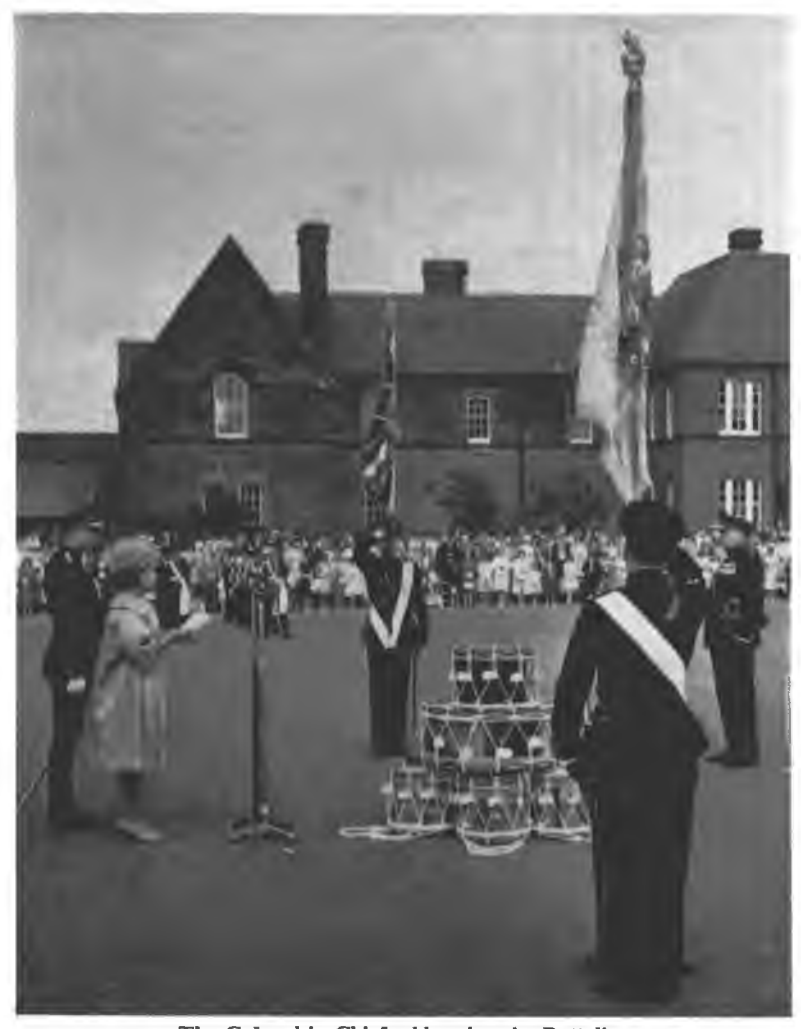
The Colonel-in-Chief addressing the Battalion