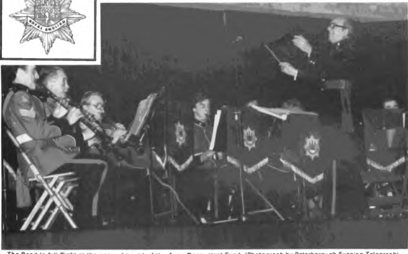
The Band in full flight at the concert in aid of the Army Benevolent Fund.