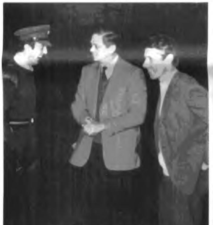
The outgoing CO says farewell to the RSM and 2IC