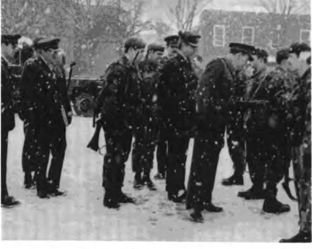
D Coy being inspected in the snow at Hyderabad Barracks.