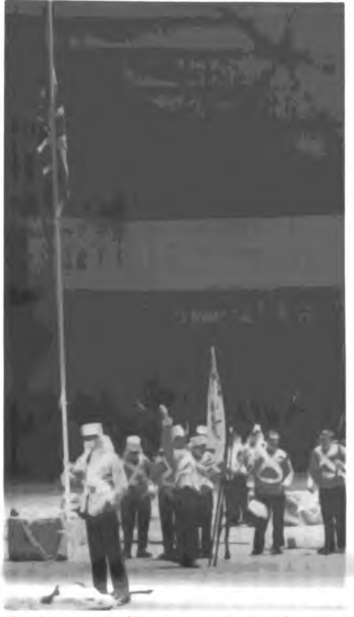
The 10th secure the Sith camp and raise the Union Jack at Sphraps.