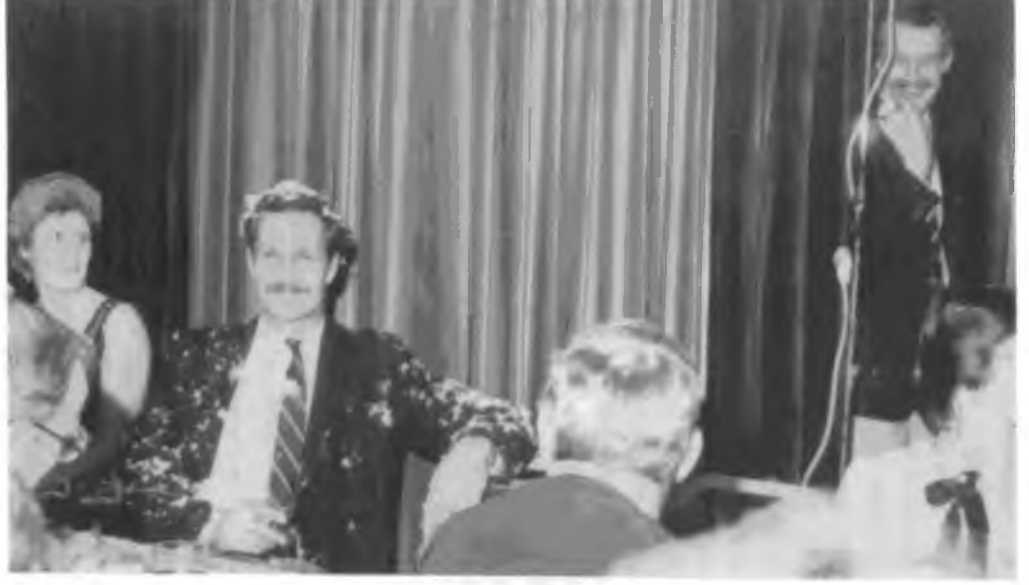
They forecast snow - but only over the RSM.

Combined Service Publications Ltd. P.O. Box 4, Farnborough, Hants. (0252) 515891