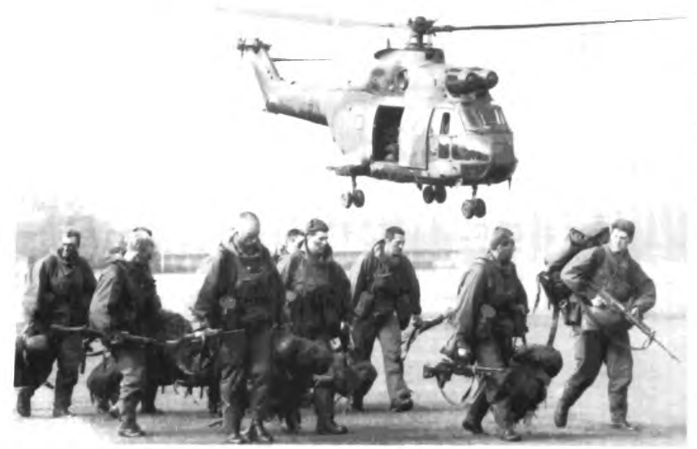
Late entries to the Polar Dawn - bring and buy salet