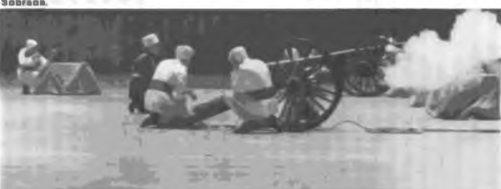
The Sith cannons in action against the 10th.