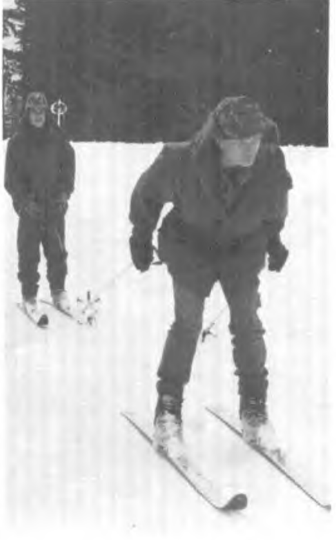
Poachers B Coy langlaufing in the Cascades.