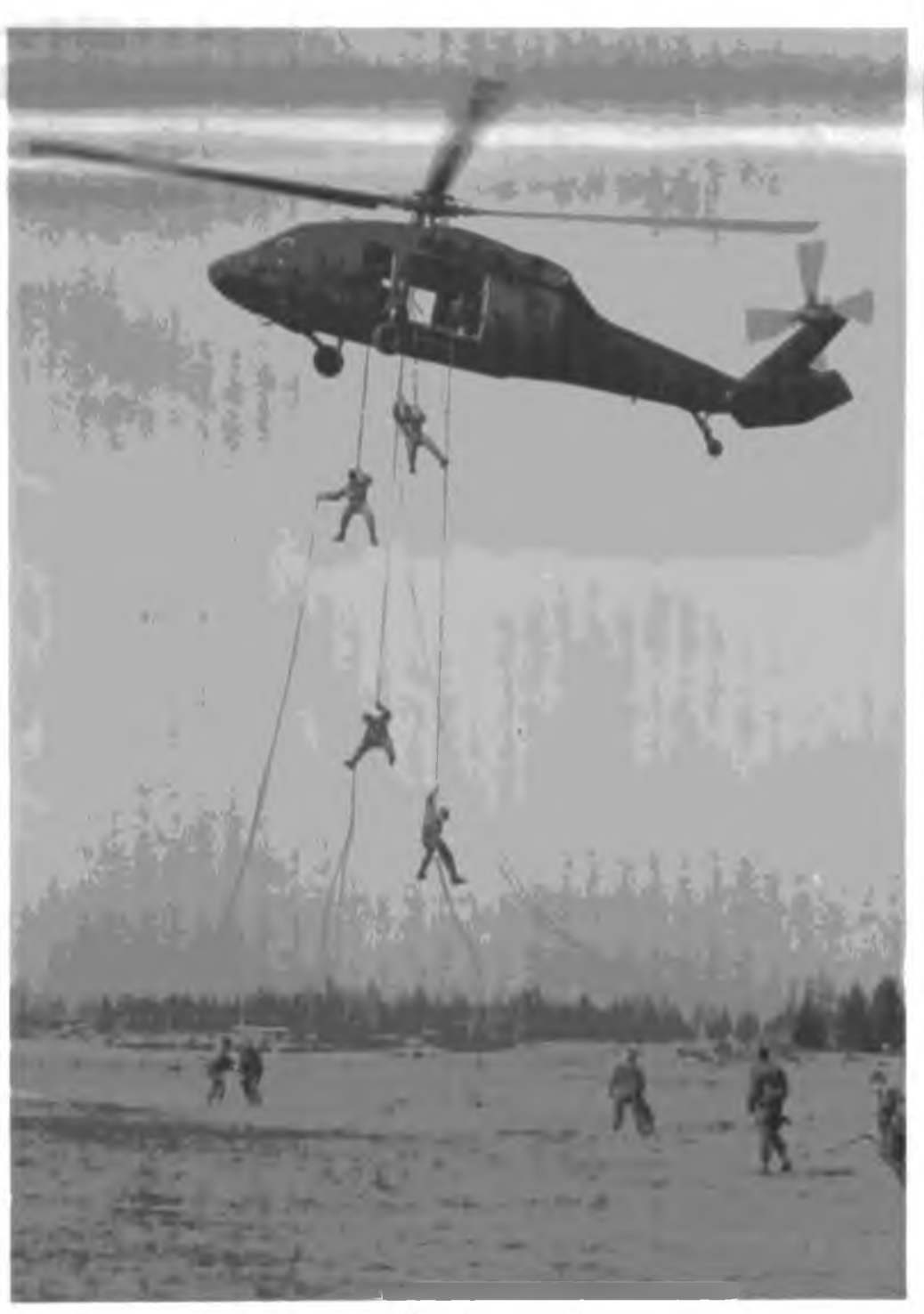
Recce Pl abseiling with US Special Forces