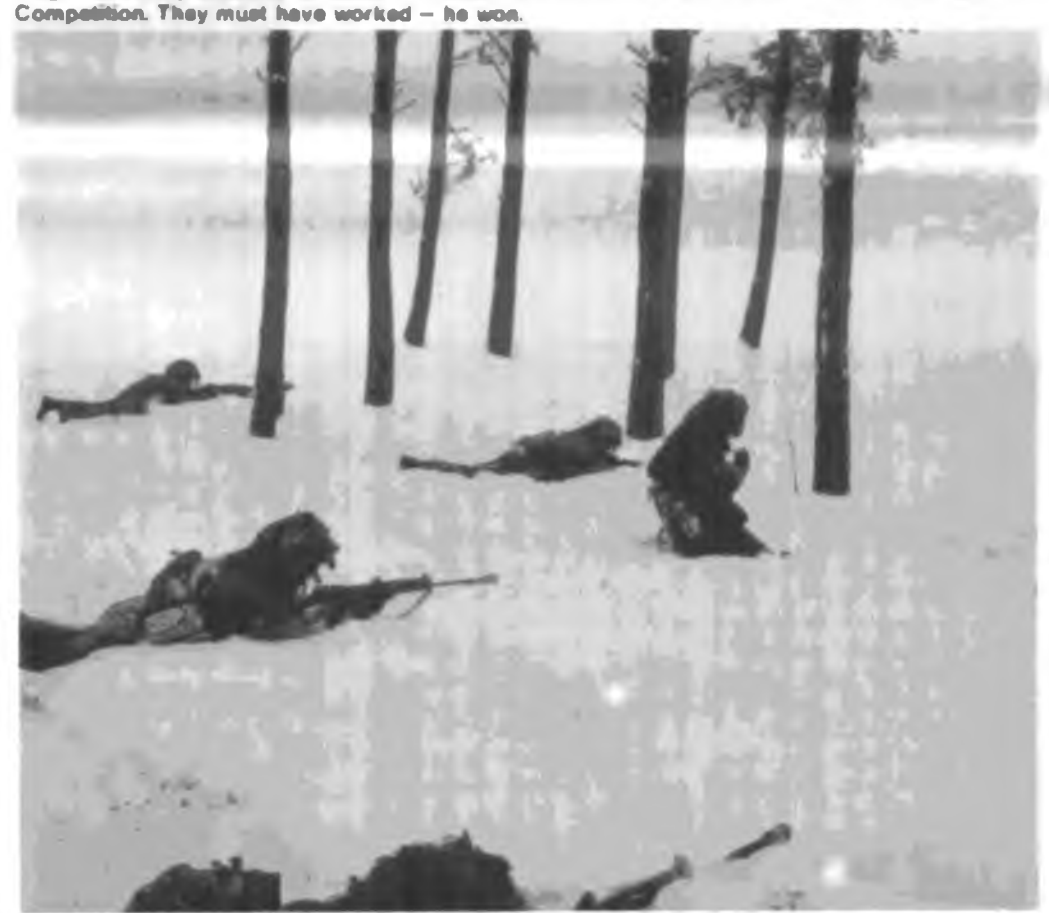
winning section reorganising after the Section Attack phase of the competition