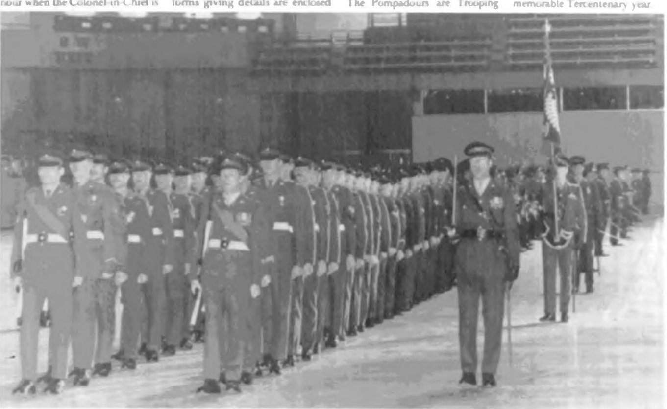
B Cov The Poachers escort the Colour during the Trooping in the Dome, See Page 7